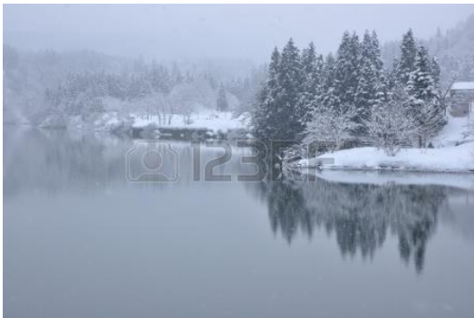
The cold climate of the suitable for the best paulownia materials

Among the domestic paulownia Fukushima Prefecture Aizu region is referred to as the "Aizu Kiri" and has a history of over 300 years. Above all it is the most valuable and finest quality in terms of aesthetics.