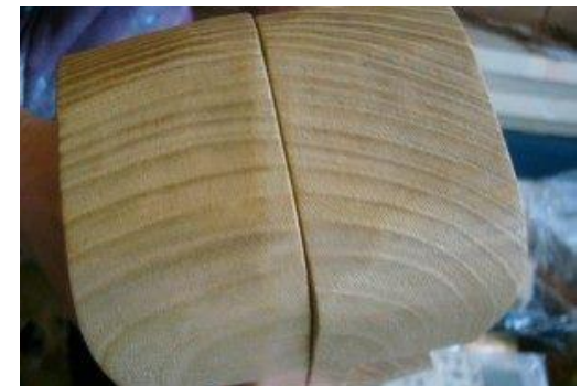
Made of one block of wood material, each straight grain fits in line perfectly.