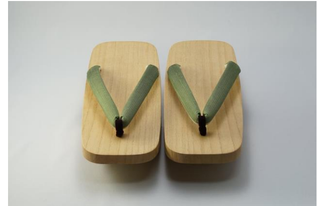
Medium size (26cm to 28cm) and Large size 29cm to 32cm)

material: Aizu Paulownia. hand crafted in Japan Medium size 26 cm Large size 28 cm