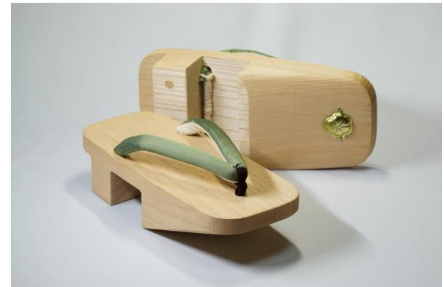
As shown in the photo the Geta is carved differently than what can be normally found making the design as a whole beautiful and also more comfortable to wear.