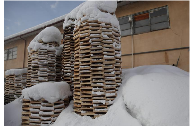
The drying process of the paulownia wood